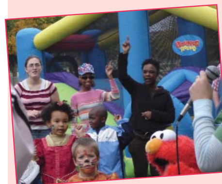
This fall Changing Lives Assembly of God sponsored a Harvest Festival. This growing congregation has a passion to connect people in mission and reach others for Christ.

We have supported TMOC on a monthly basis for many years. We recognize that TMOC is meeting practical needs and reaching people that we would not otherwise be able to reach. As a church, we can make a difference through other ministries that have access to touch and change lives around the metro area, the region and the world.