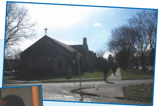
Berean Family Worship Center at Capital and 51st Street hosted this year's Thanksgiving Celebration of Love.

At the end of the day there was a sense of awe in what had just happened. We remembered the Scripture in Hebrews 13:2,3: "Never forget to welcome strangers, for by this some have entertained angels without knowing it. Remember the prisoners, as though in prison with them, and those who are ill-treated, since you yourselves are in the world."