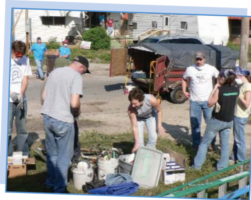
Before going to work in the Ninth Ward, Katrina relief workers from Cornerstone Church put on safety masks to protect themselves from mold and dust.