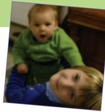
Sisters enjoy their dinner at Celebration of Love on Thanksgiving while their mother volunteered as a table host.

Volunteers are needed for Celebration of Hope on March 19. To help, call TMOc at 414-385-2233.